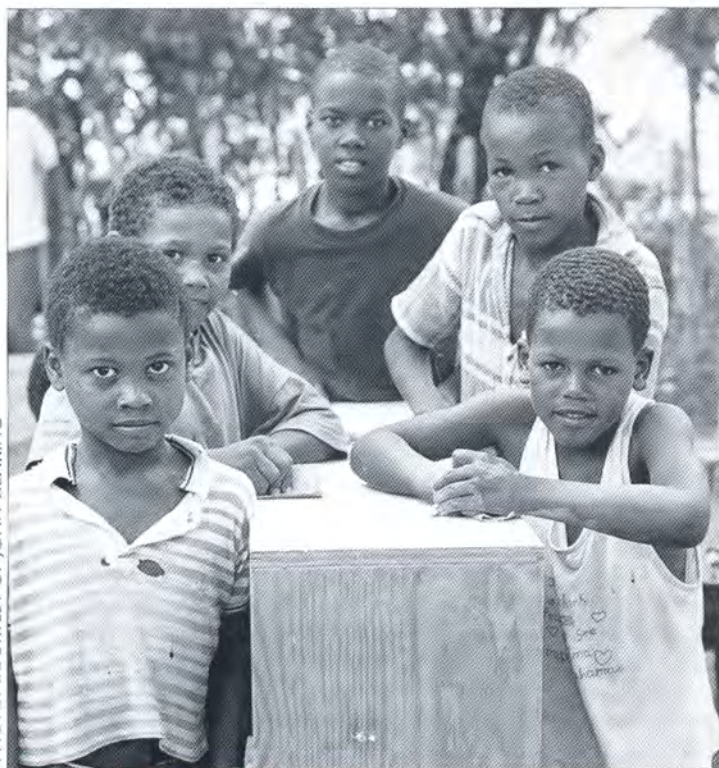
Children help scraping furniture.