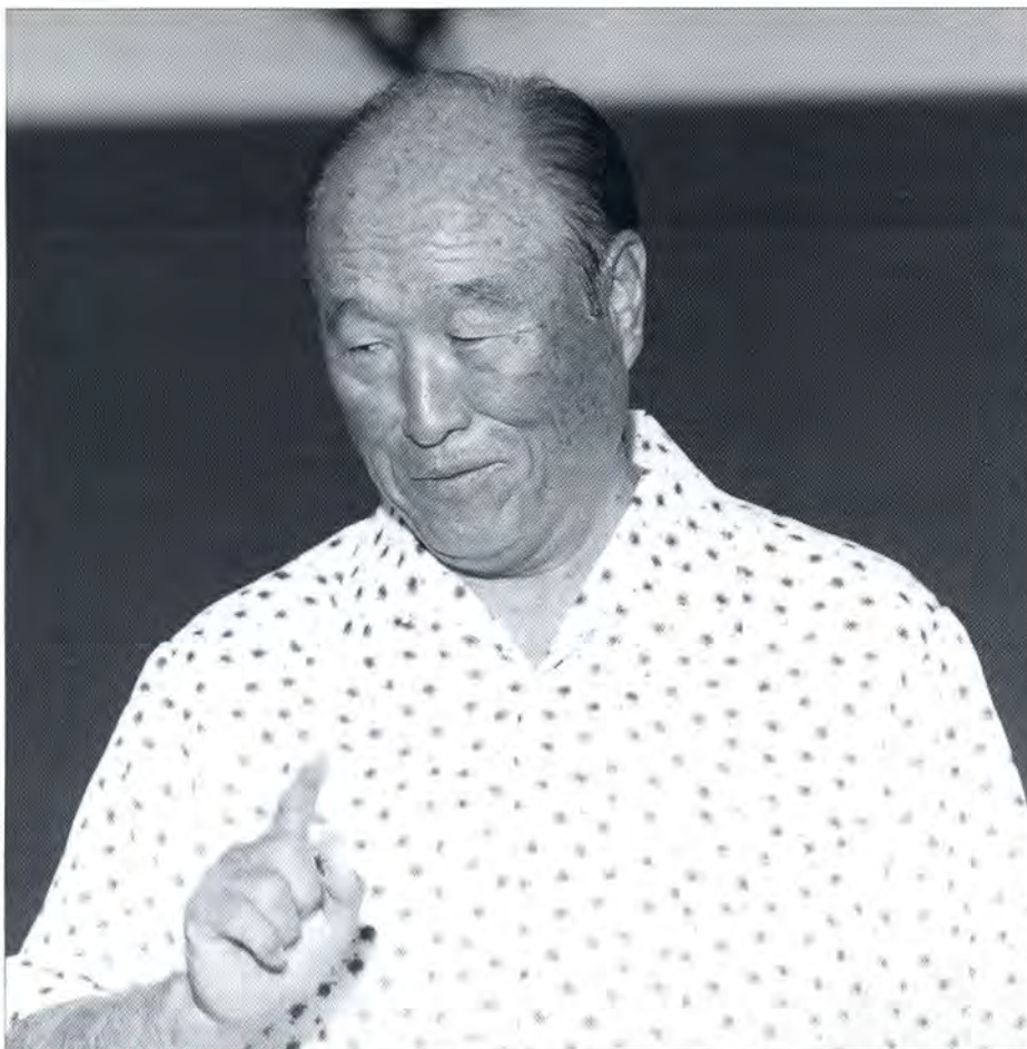
East Garden, June 6, 1997.

vest comes, you can move on. We do not need big cities.