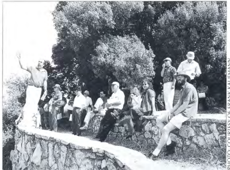
Conferees from both the US and Israel tour ancient Biblical sites.

The day unfolded as if scripted by CONTINUED ON THE NEXT PAGE