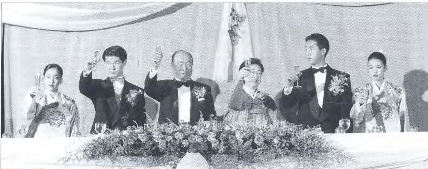
True Parents offer a toast for the newly blessed couples.