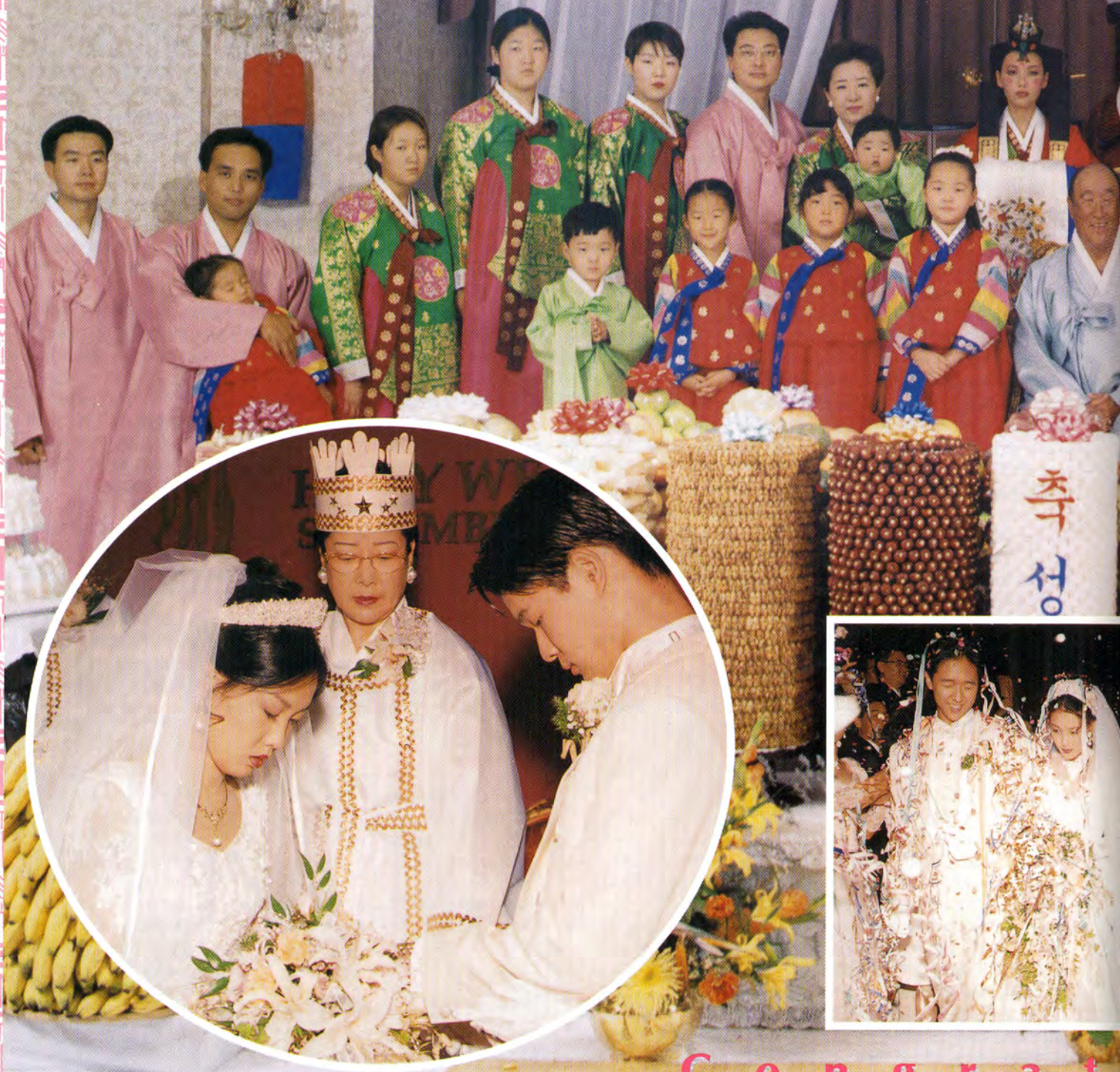
The True Family poses for a portrait following the Peh Baek Ceremony.