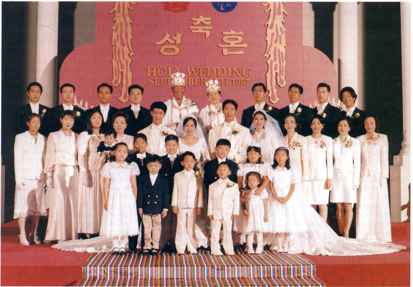
True Family Portrait at the Manhattan Center, Hammerstein Ballroom. September 6, 1997.

“Just like God, whatever I do, wherever I look I offer my love, so my life is totally centered upon the give and take relationship of love. This is my life. The original palace of Amen is the Kingdom of God in Heaven. That is our destination. From there we can inherit everything from God. Amen.”