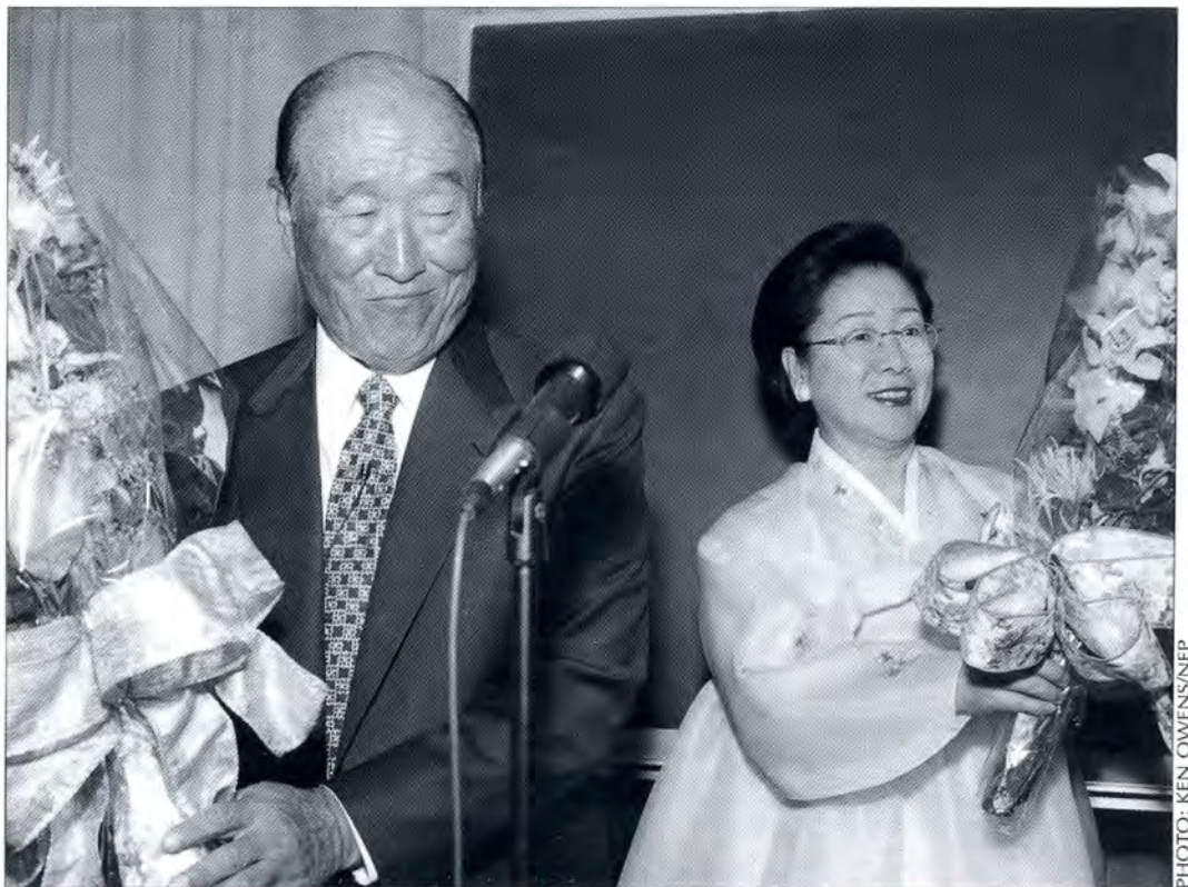
True Parents receive flowers on the 35th True Day of All Things before Father's speech at Belvedere, in Tarrytown, New York.

Some people claim that the teaching of Divine Principle is excellent, but once they step inside they have to go through